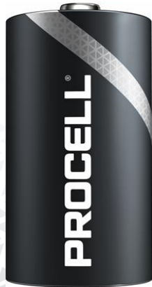
Size: D (LR20) PC1300